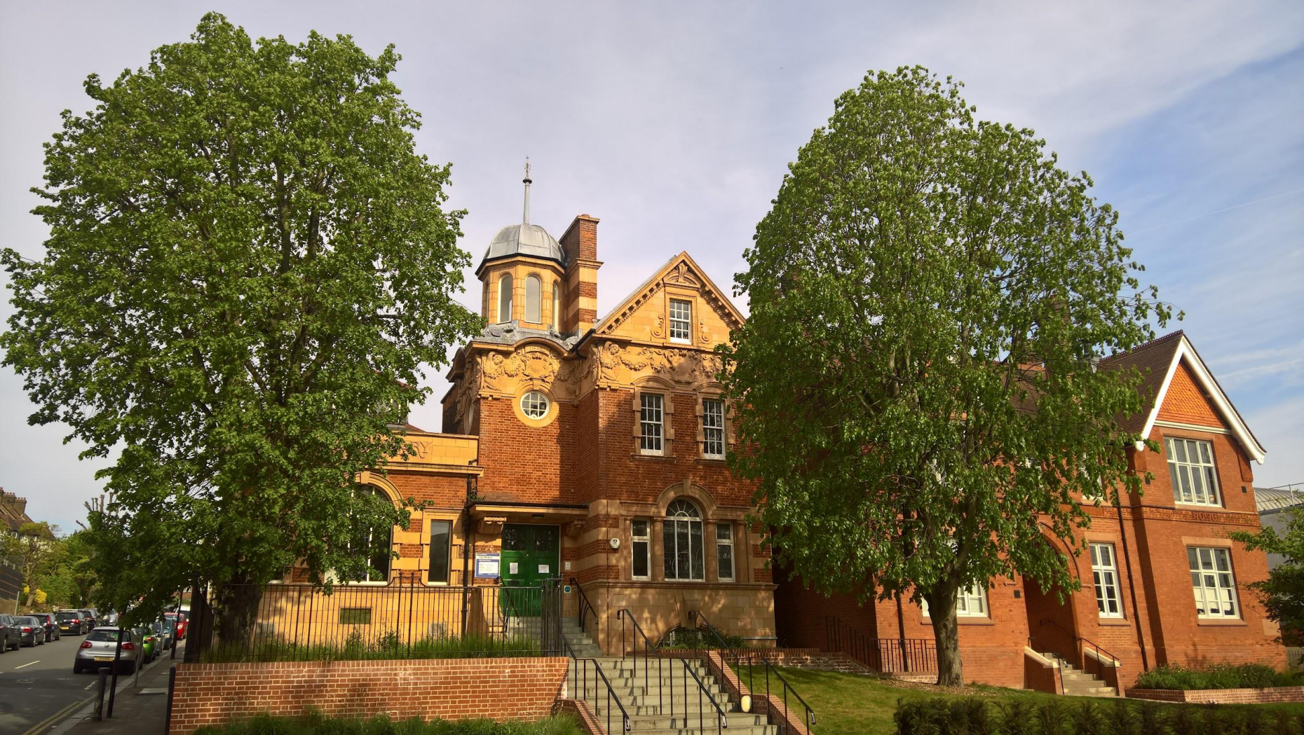
V22 FOREST HILL LIBRARY