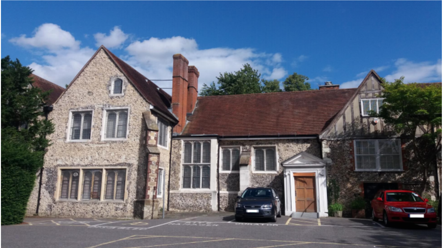
V22 THE PRIORY, ORPINGTON