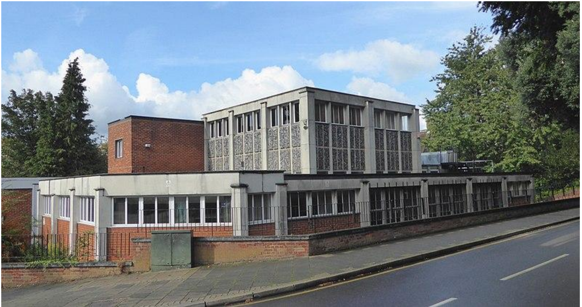
V22 THE OLD LIBRARY, ORPINGTON