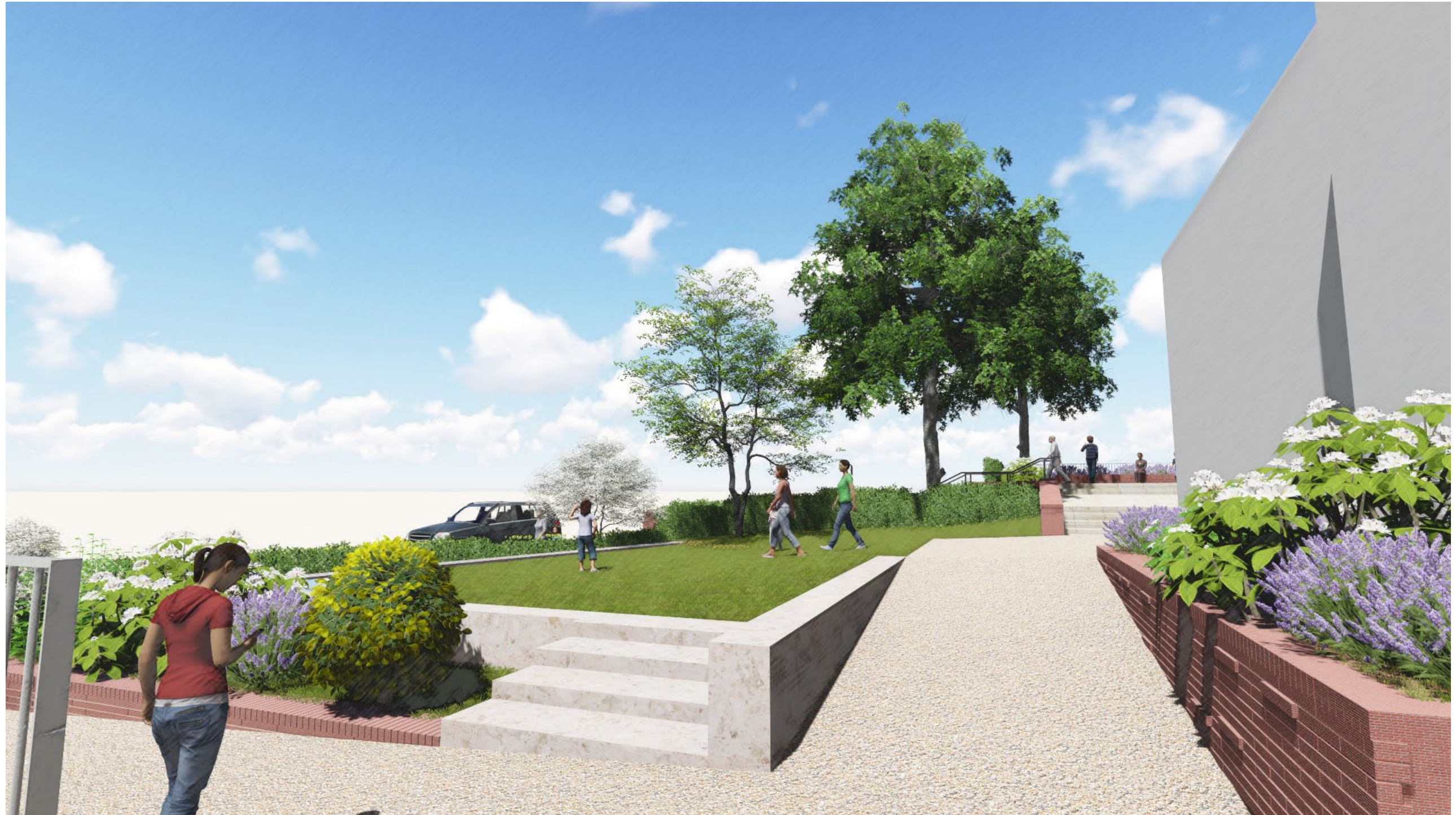
VIEW FIVE- Louse House Entry walkway looking toward Forest Hill Library