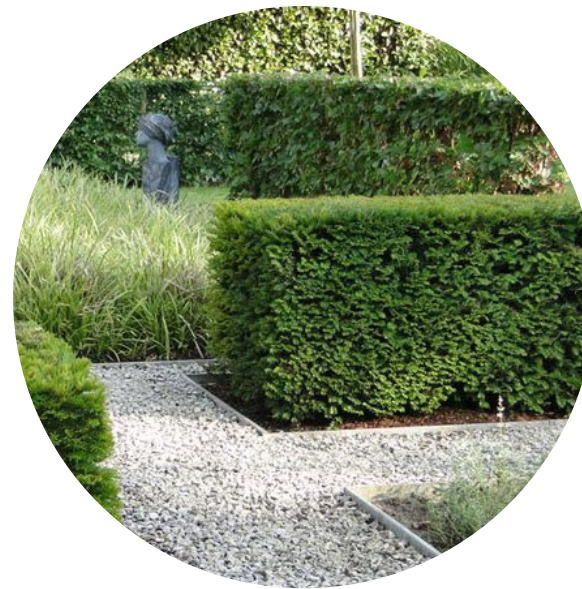
POTENTIAL AREAS OF FORMAL PLANTING