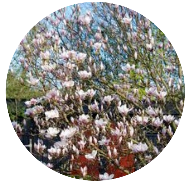
FLOWERING TREE SPECIES