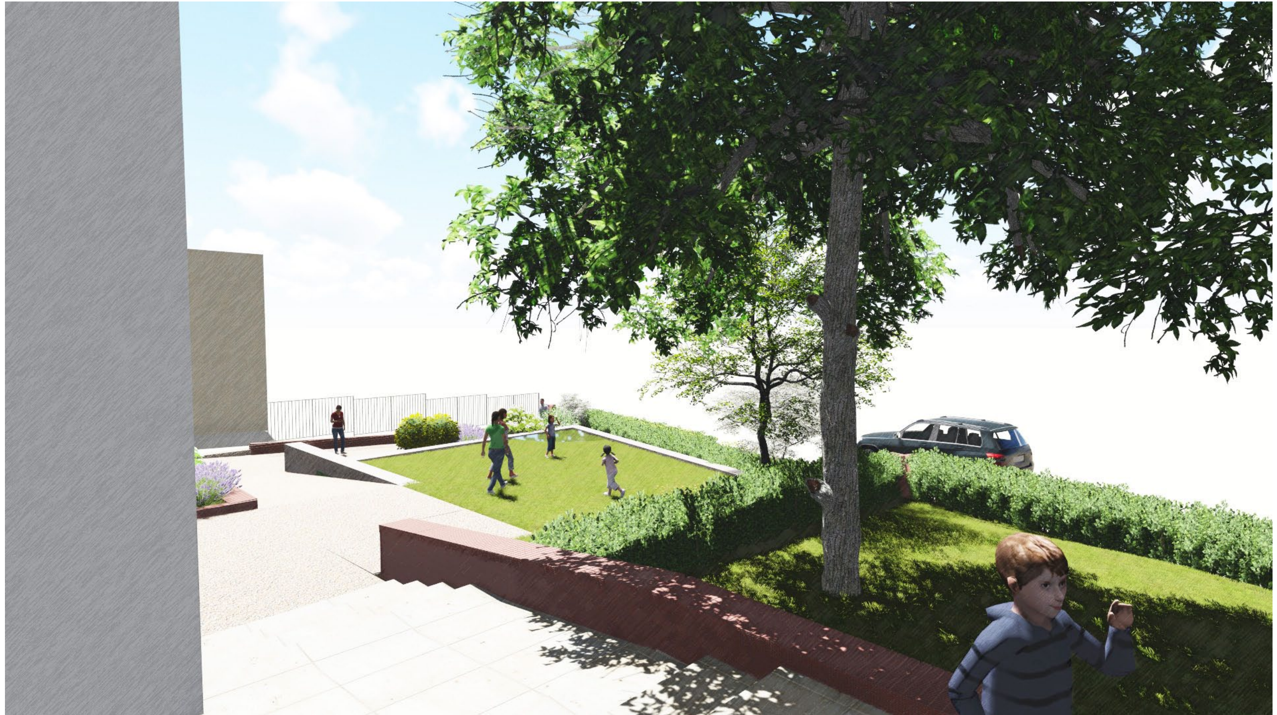
VIEW THREE - Exhibition Garden from Forest Hill Library Terrace