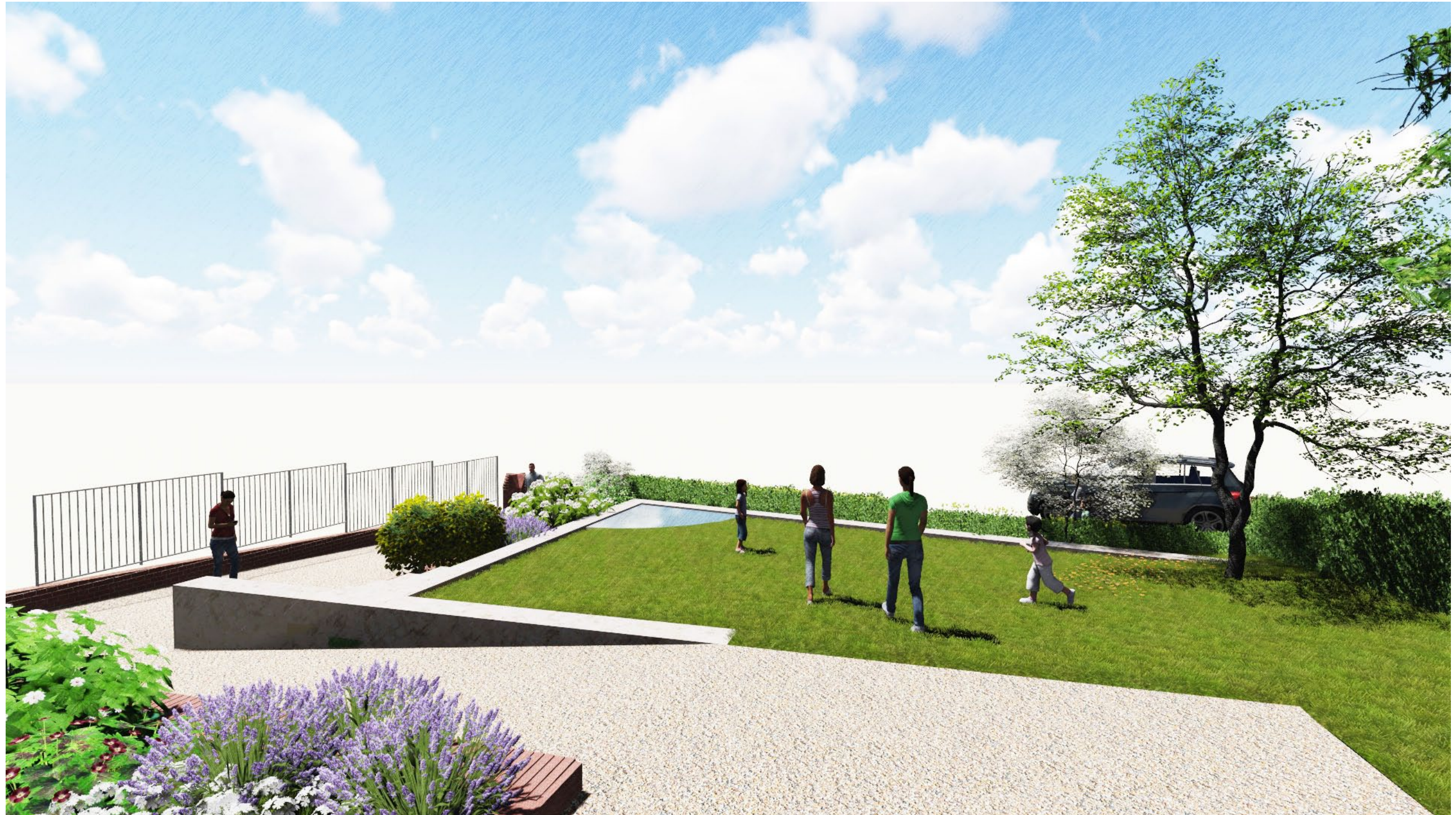
VIEW FOUR - Exhibition Garden from Louise House entry