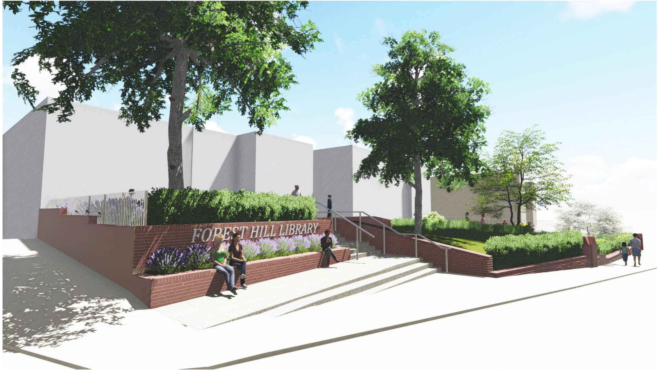
VIEW ONE - Forest Hill Library Entry