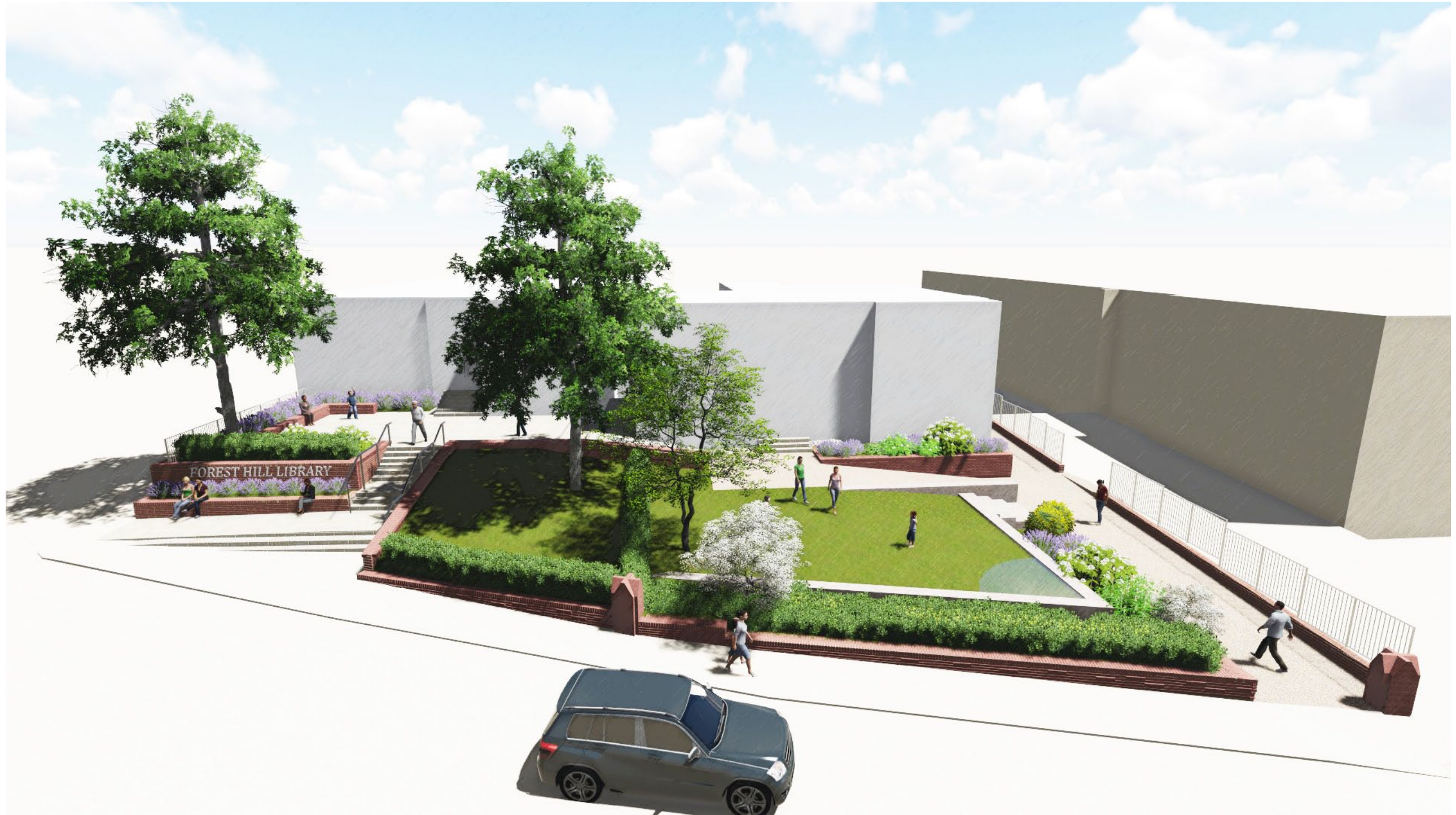
VIEW SEVEN - Raised viewpoint looking down at Louise House Front Garden and Forest Hill entry landscape