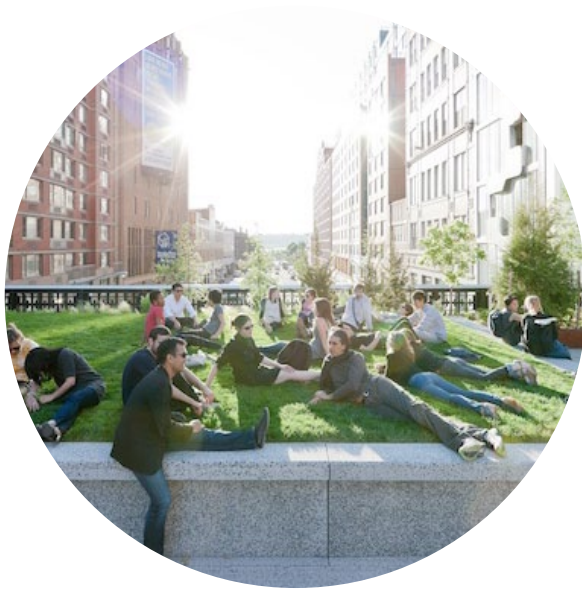
WALLS/ SEATING EDGE