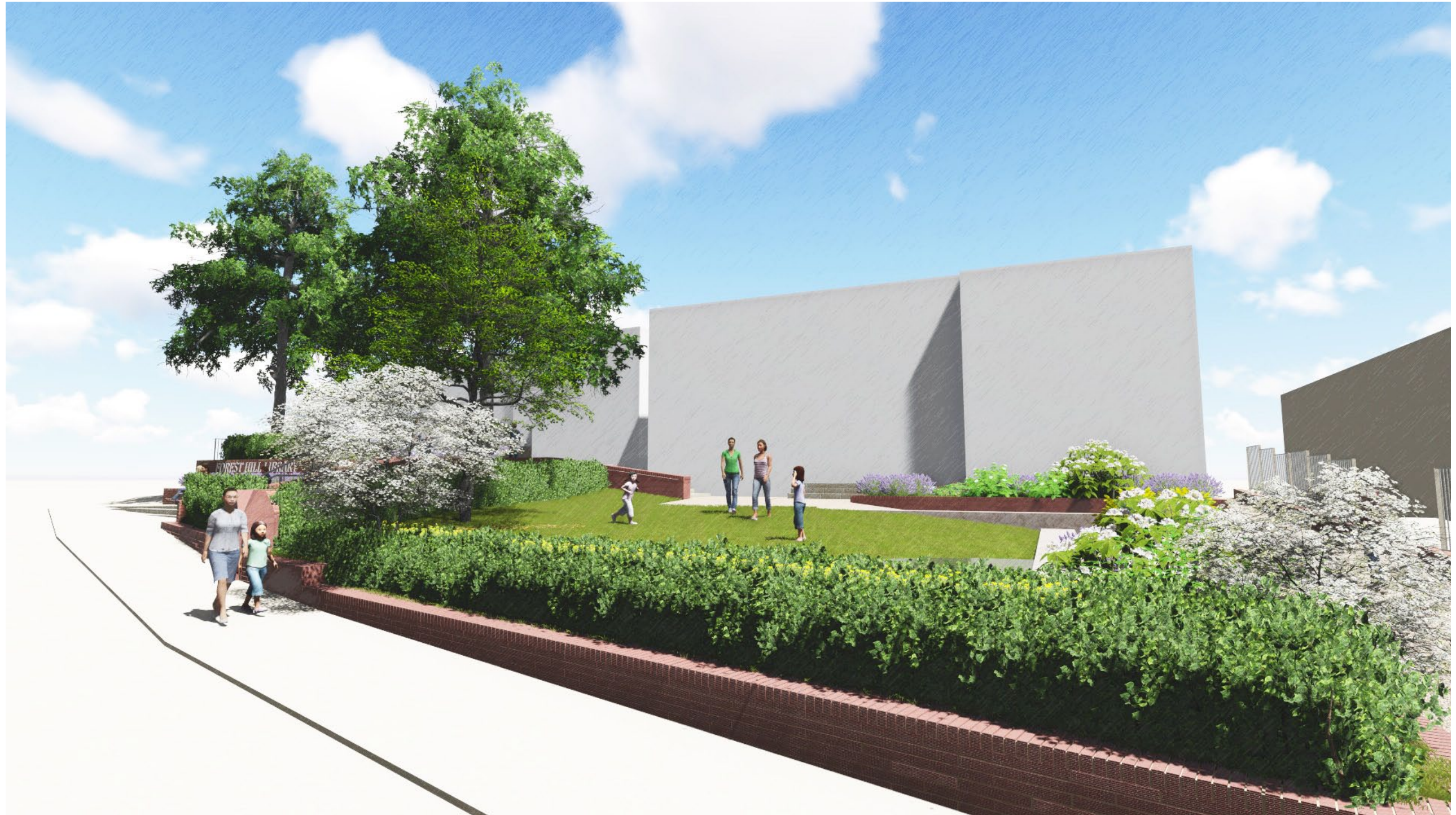
VIEW SIX - Exhibition Garden from Dartmouth Road