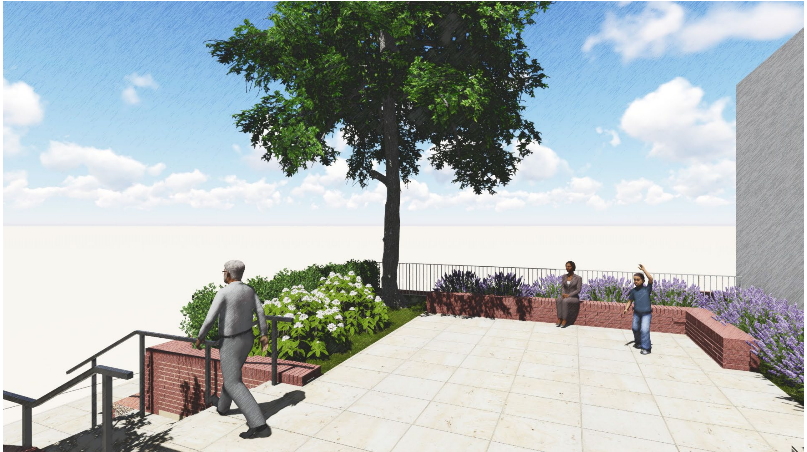
VIEW TWO - Forest Hill Library Upper Terrace