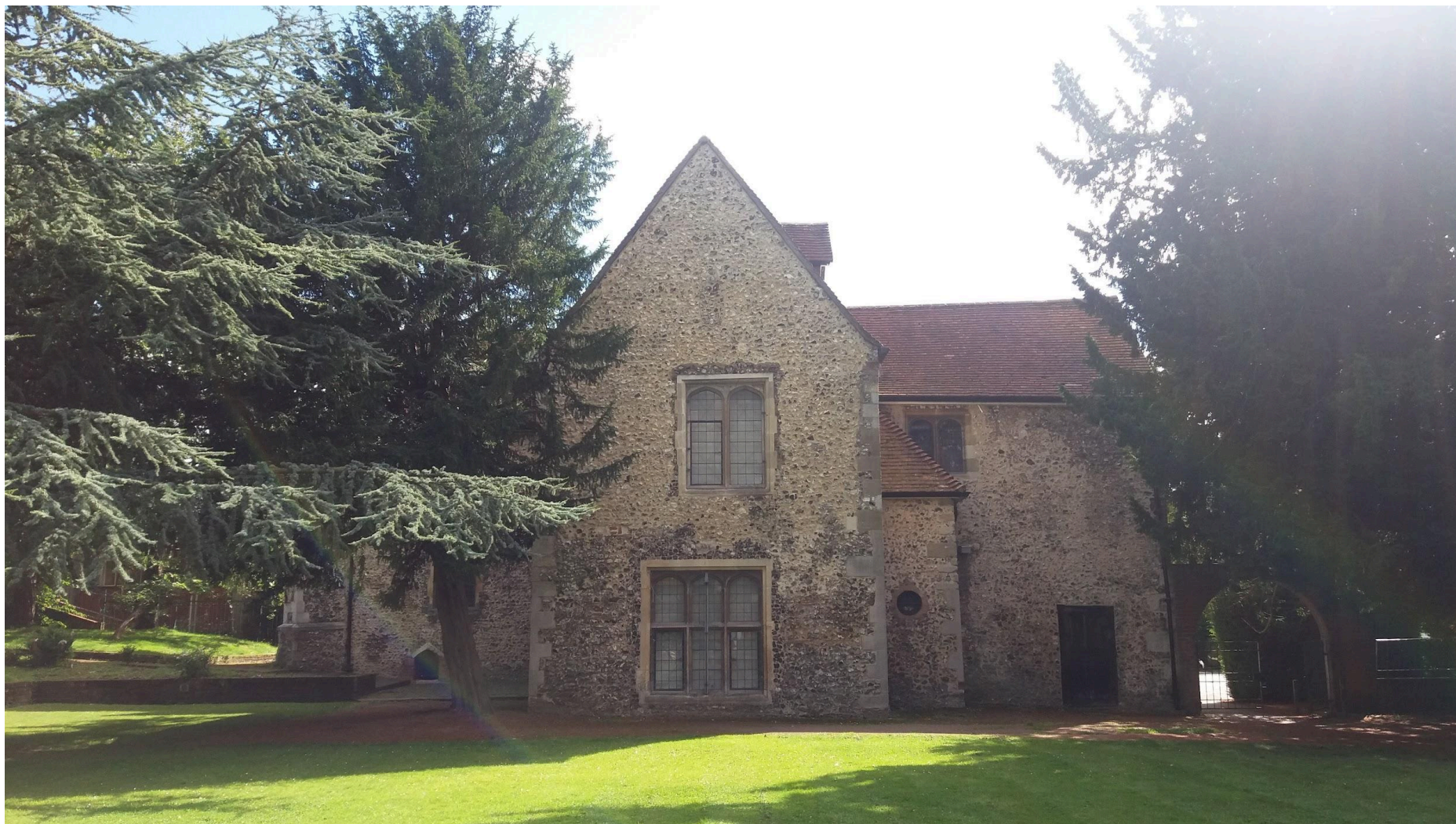
V22 THE PRIORY, ORPINGTON